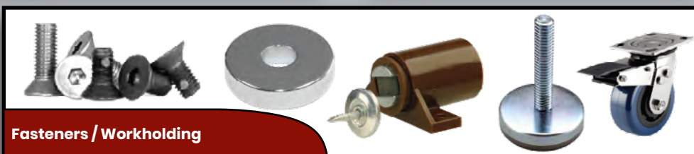
Fasteners / Workholding