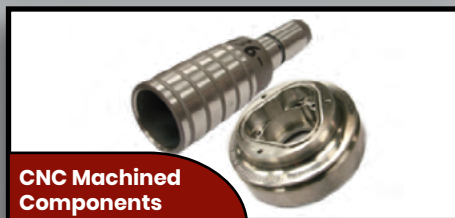
CNC Machined Components